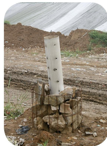
Degassification drilling at Xinyang landfill site.

It is estimated that during the 10 years crediting period the proposed project activity will destroy 21,259 tons of methane and replace 117,000 MWh of electricity otherwise generated via fossil fuel combustion: this will mean a potential GHG reduction of approximately 420,645 t CO 2 e.