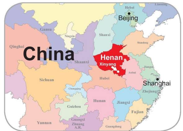
The map shows the project location in China's Henan Province.

Disclaimer: The information provided in this publication is for reference only. originating from its usage (whether or not authorized) particularly from any claim on its incompleteness and incorrectness.